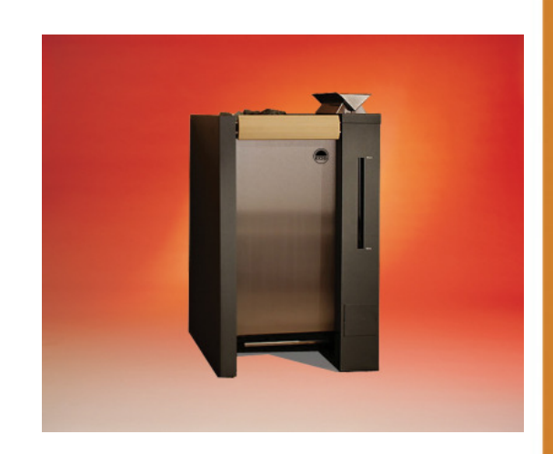
C € MADE IN GERMANY

Optimised ratio of radiated heat and convection due to the appropriate amount of stones.